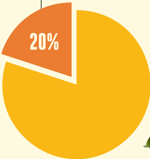
Appetisers represent a fifth of the Total Meal Bill