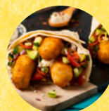
Potato Cheese Shotz