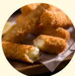
Breaded Mozzarella Sticks