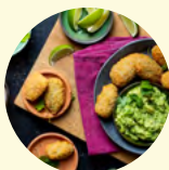
Cream Cheese Jalapeño Poppers