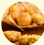
Chilli & Cheese Nuggets